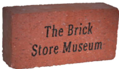
Sample commemorative brick

Create a lasting impression with a personalized, engraved brick. These handsome, wire-cut red clay bricks make great gifts and are a wonderful way to honor