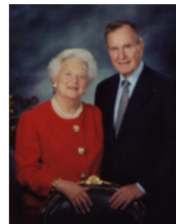
President George H. W. Bush and Barbara Bush

we preserve, protect and interpret our times for the generations that follow.